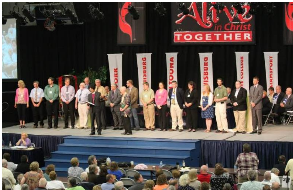
Introducing Local Pastors at Annual Conference 2013