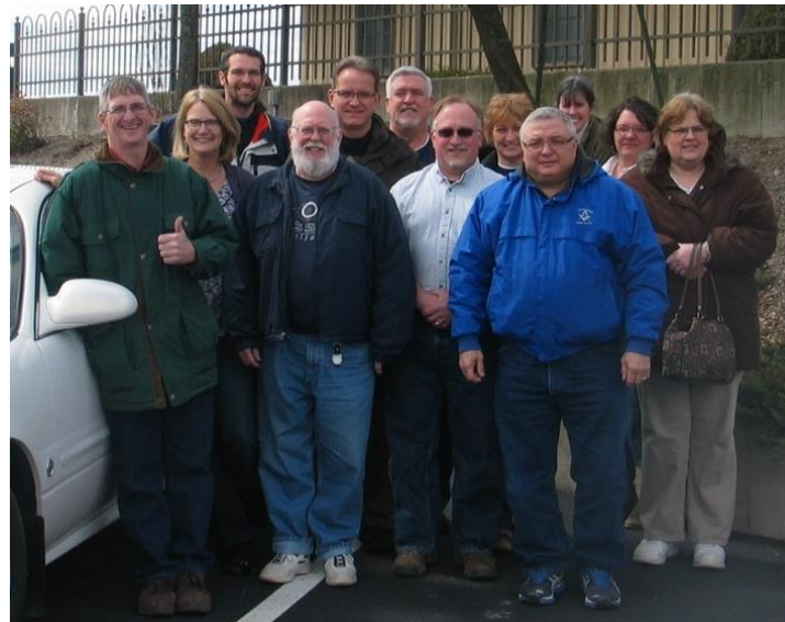
2013 Local Pastor's Licensing School Class

This is a time for new beginnings! You have heard the call of God to enter into the ministry of the United Methodist Church, and now you are on your way. I welcome you to what is a great adventure that begins with your first class and continues beyond as you are licensed and sent forth by our Bishop. To paraphrase an ad that I have seen for a business school: “YOU ARE NEEDED.” Indeed you are, and as you read through this handbook, you will discover that training for ministry as a Local Pastor does not end at the conclusion of ten Saturdays, but is a lifelong venture into all the courses you will experience. I urge you to realize that you, as never before, are asked to “Make Disciples for the Transformation of the World.” This is your calling. This is your task. This is your ministry!